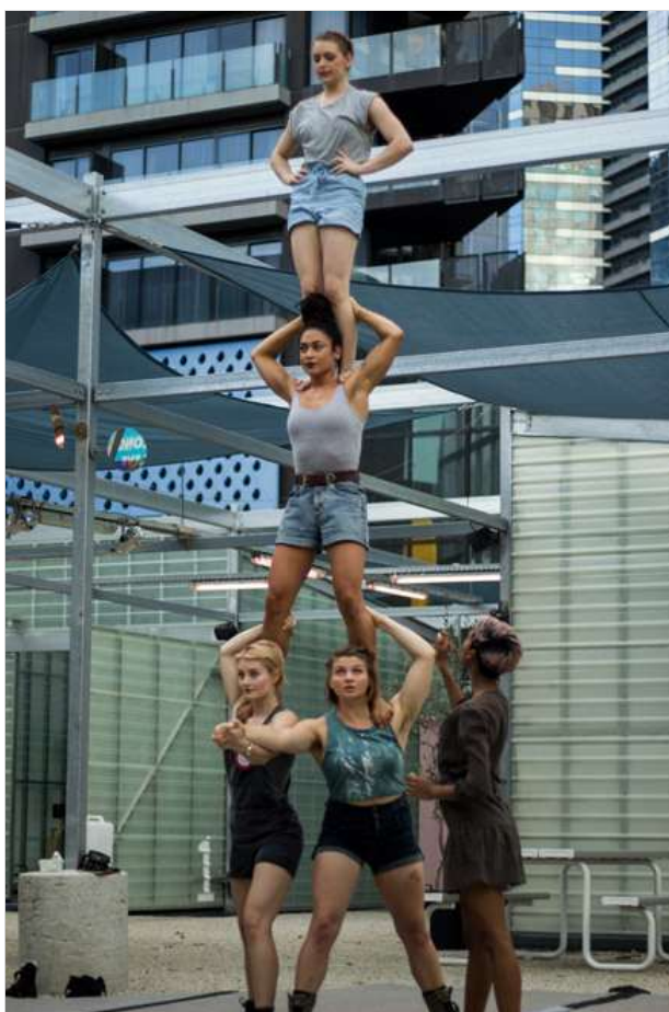
Tons of Sense form a human tower

I recently had the pleasure of attending the inaugural live performance by Melbourne acrobatic collective Tons of Sense . Their show Stand Here is an immersive circus experience like no other, featuring seven talented women.